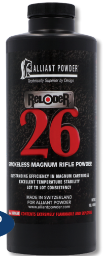
RELODER 26 OPTIMUM LOADS: Outstanding efficiency in magnum cartridges

Delivers high energy in magnum cartridges