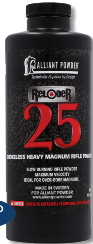
RELODER 25 OPTIMUM LOADS: Magnum rifle