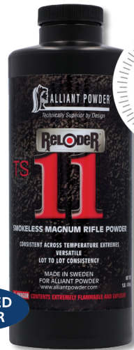
RELODER TS11 OPTIMUM LOADS: Varmint

For light bullet applications in 222 Rem, 22-250 Rem. and 223 Rem.