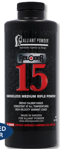
RELODER 15 OPTIMUM LOADS: Medium rifle

Ideal for varmint and short-range benchrest applications. Excellent stability.