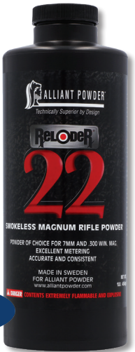
RELODER 22 OPTIMUM LOADS: Magnum Rifle

Excellent in short-action calibers, especially 308 Win.