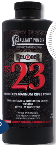
RELODER TS23 OPTIMUM LOADS: Standard and magnum rifle

Outstanding in 7mm Magnum and 300 Win. Magnum applications