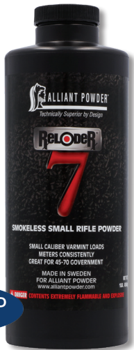
RELODER 7 OPTIMUM LOADS: Light rifle