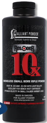
RELODER 10x OPTIMUM LOADS: Light varmint

Great in lightweight 223 Rem. varmint loads